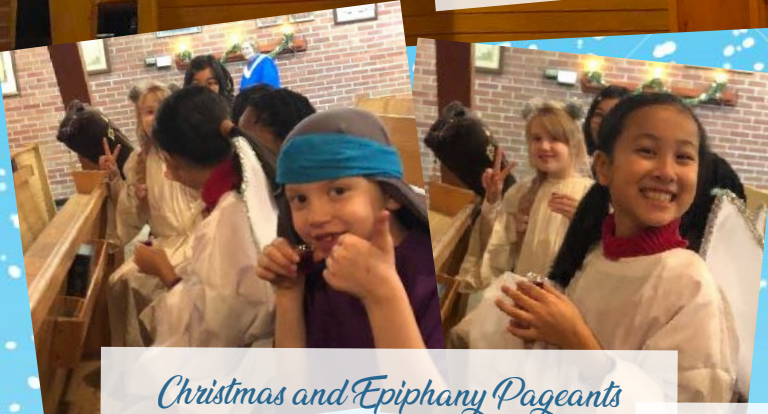
Christmas and Epiphany Pageants