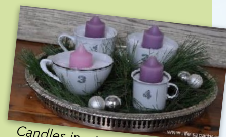
Candles in a teacup? Why not?