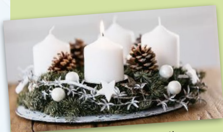
Grab a few pine cones, pillar candles, and some Dollarama finds and voilà!

Need some inspiration? Check out these creative do-it-yourself wreaths: