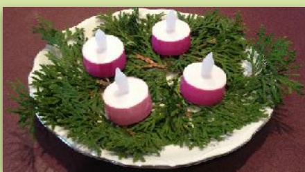
Here's a kid-friendly version: battery operated tea lights. What fun!