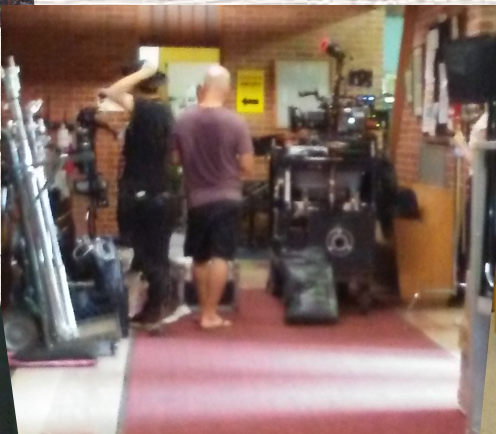
filming at Trinity